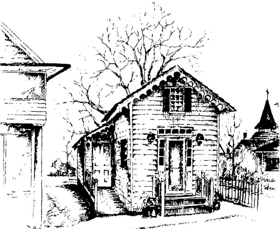
Stevensville Post Office (Circa 1877)

Kent Island has prospered and dramatically changed since its founding in 1631. Understand the many challenges that face the Isle today: the Bay Bridge, new development, and our fragile environmental issues.