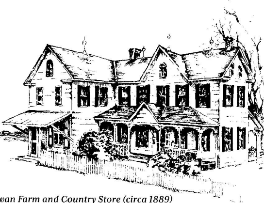
Kirwan Farm and Country Store (circa 1889)

The Society works diligently to assist our youth and mature history enthusiasts to acquire an appreciation of Kent Island's place in the history of our state and nation.