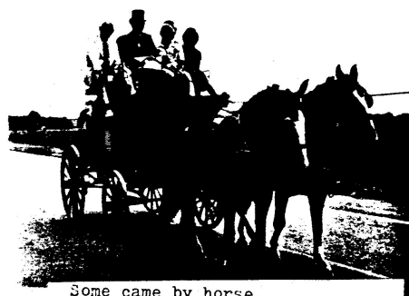
Some came by horse.