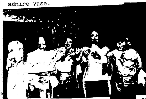
A PATENT FOR CONFLICT : A toast