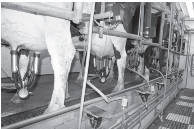
Cows in stalls at milking barn